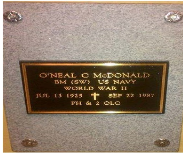
BRONZE NICHE (Z)

This niche marker is 8-1/2 inches long, 5-1/2 inches wide, with 7/16 inch rise. Weight is approximately 3 pounds; mounting bolts and washers are furnished with the marker. Used for columbarium or mausoleum interment. Also provided to supplement a privately-purchased headstone or marker for eligible Veterans who died on or after November 1, 1990 and are buried in a private cemetery.